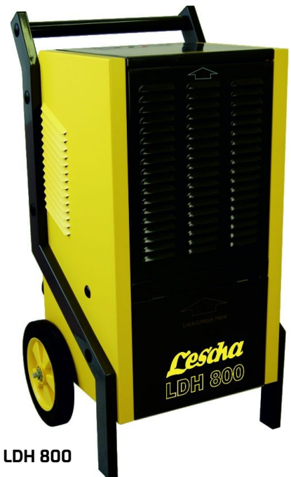
Type: LDH 800