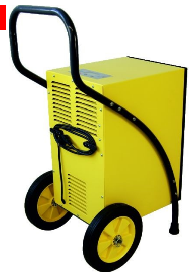
Back side, photo above: LDH 300 Photo below: LDH 600 & LDH 800