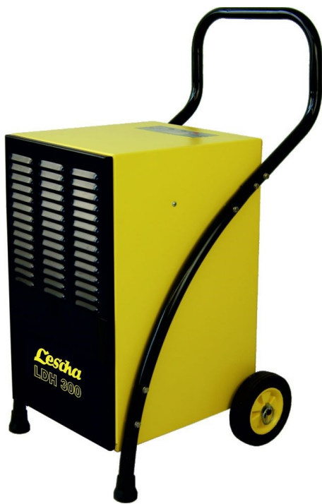
Type: LDH 300

The Altrad Lescha LDH dehumidifiers are efficient and effective air dryers with a digital and programmable display. Easy to use and with a high drying capacity.