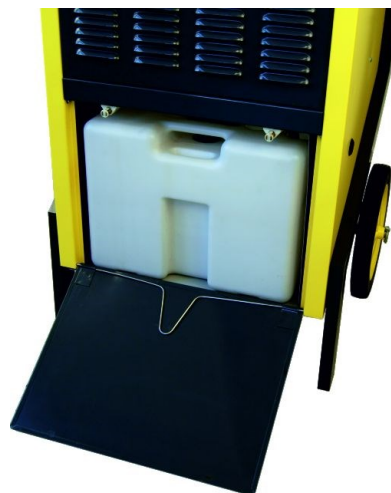
Efficient operation. Large capacity water tank. Photo left: LDH 300 / Photo right: LDH 600 & LDH 800