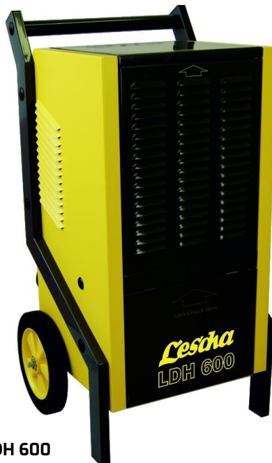
Type: LDH 600